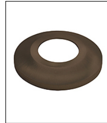
COL1-A10C-BZT FC-11 Cast Alum 1-Piece