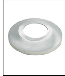
COL1-A10C-CLR FC-11 Cast Alum 1-Piece