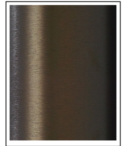
Anod. Dark Bronze