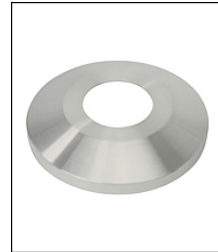
COL1-A08S-ACL FC-11 Spun Alum 1-Piece