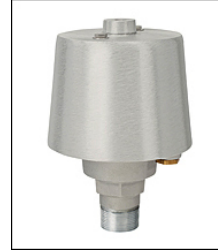
TRK-9650-ACL Int. Revolving Truck Sealed Bearings