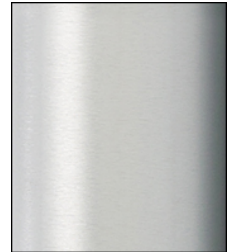
ACL Clear Anodized