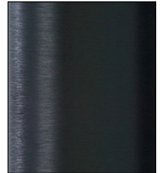
ABL Black Anodized