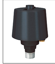
TRK-9650-BLK Int. Revolving Truck Sealed Bearings