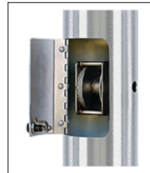
IWW - WINCH Flush Mount Hinged Door

NOTE: Flagpole Components on Anodized and Powder Coat flagpoles (excluding specified Ornaments and Ball Trucks) will match flagpole color specified.