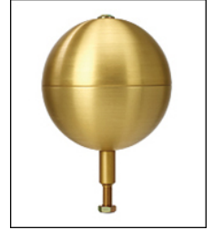
BAL-0812-GLD HD Gold Anodized Aluminum Ball