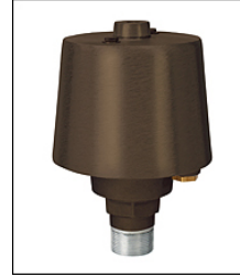
TRK-9650-BZT Int. Revolving Truck Sealed Bearings