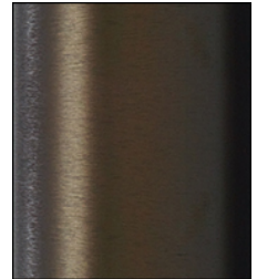
ADB Dark Bronze Anodized