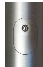
FOR 7-8" DIAMETER POLES